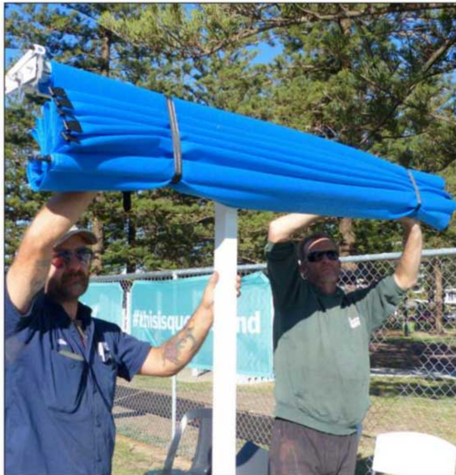
• Shadex technicians ensure every aspect of the installation adheres to a strict best practice criteria.

bowls but has owned Shadex Industries since 2001, using his engineering background to good effect and improving the shade design and longevity.