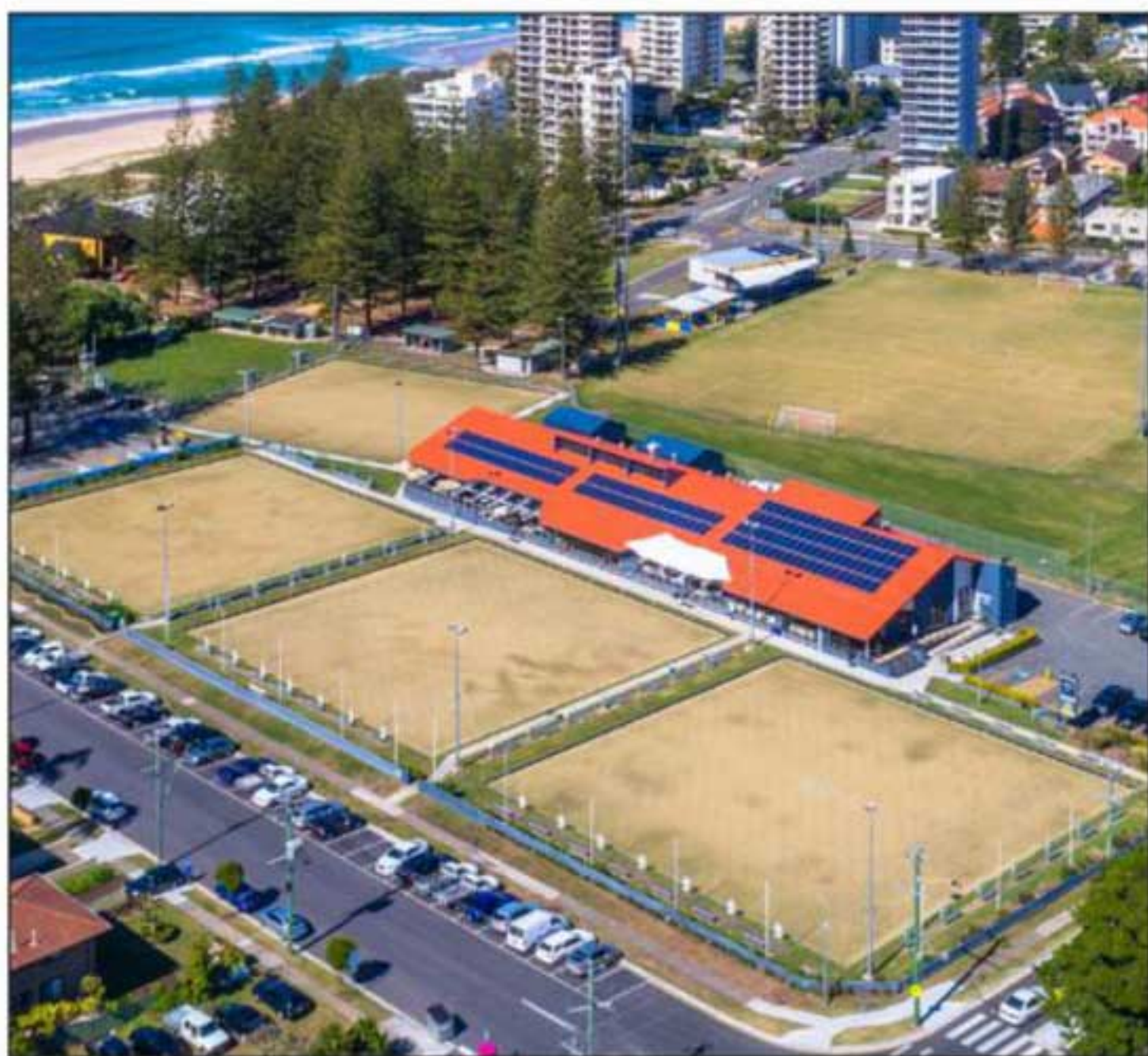
• Post-Games, Broadbeach restored to its former state.

challenge despite being able to point to a long list of clubs - at the last count around 1500 - who had benefitted from the Shadex expertise over these past 30 years as they supplied and, in many cases, installed sun protection at bowling clubs across Australia, New Zealand, USA and Canada.