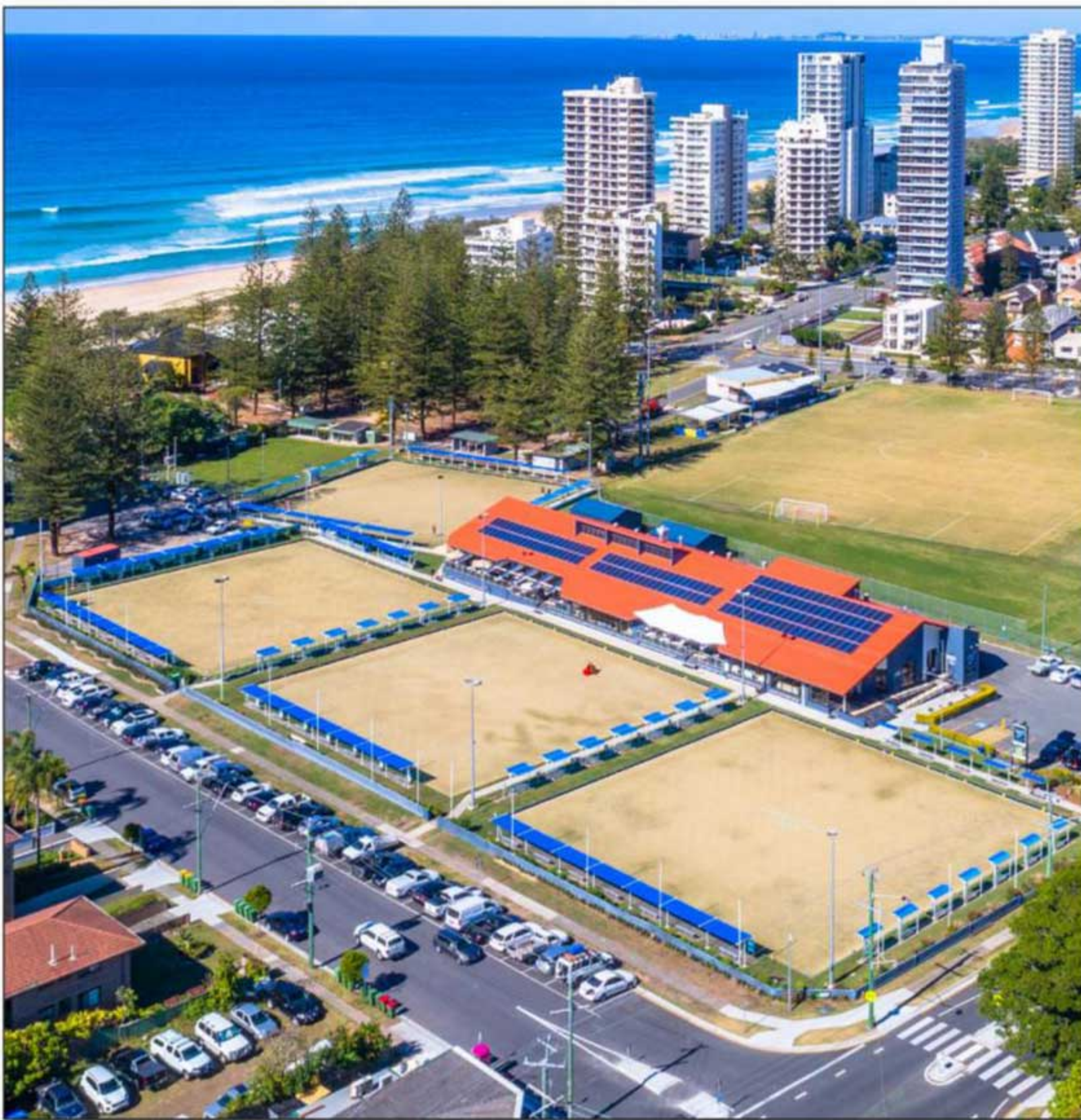
• Dressed to thrill - spectacular Broadbeach after the Shadex team installed the innovative new greenside shades to all four greens.