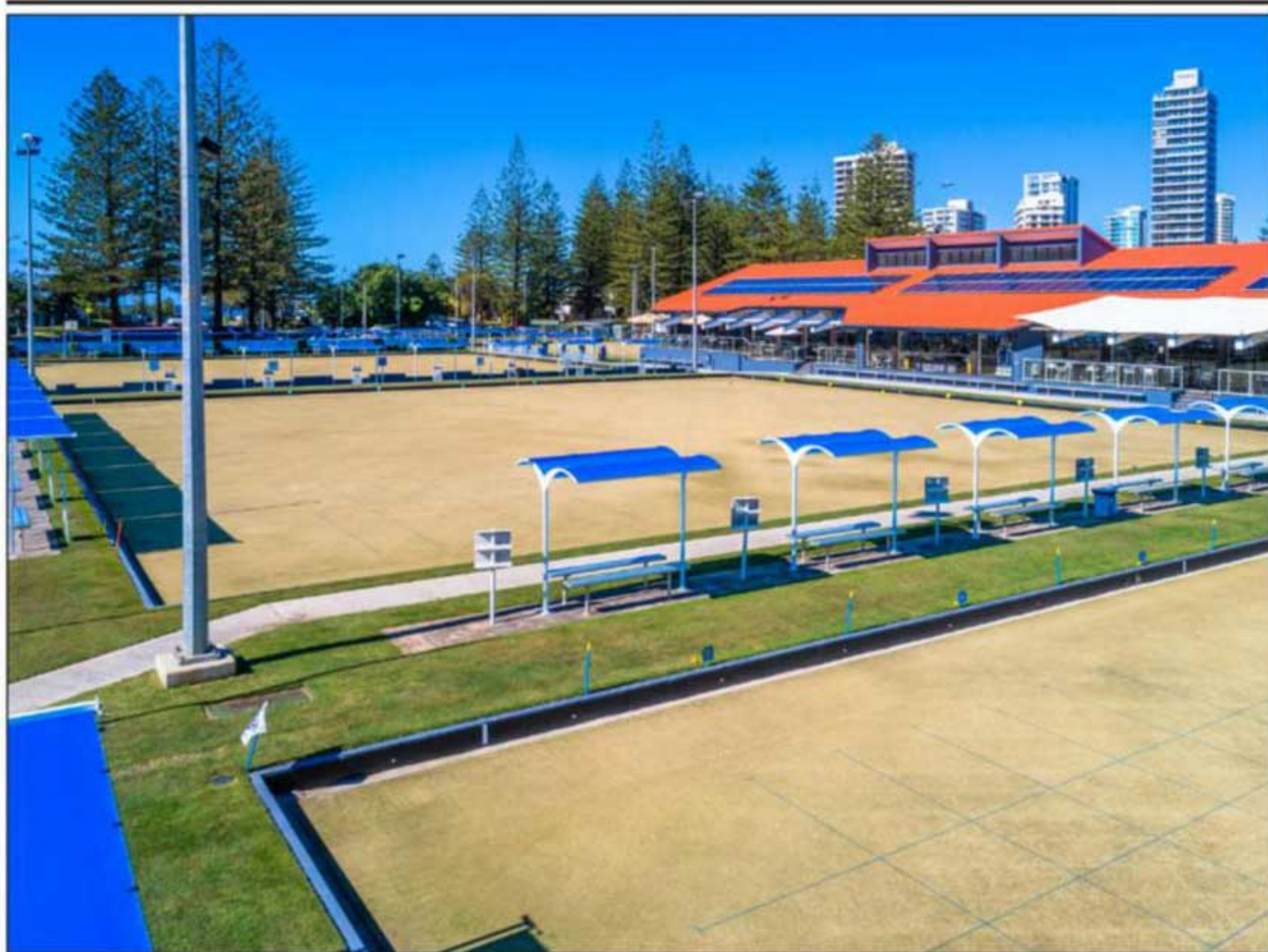
• The Shadex 'Riviera Coastal Range' provided a stunning transformation to the world-renowned Broadbeach Bowls Club on Australia's Gold Coast.