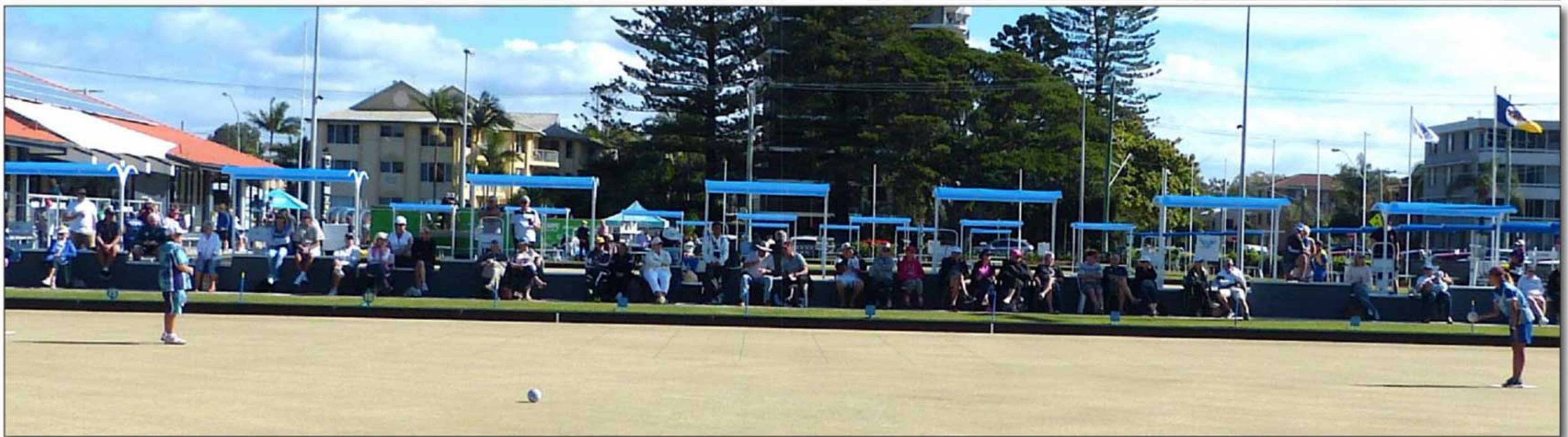
• The latest and greatest in greenside shades from Shadex offers the ultimate in protection from the sun to spectators and bowlers alike.