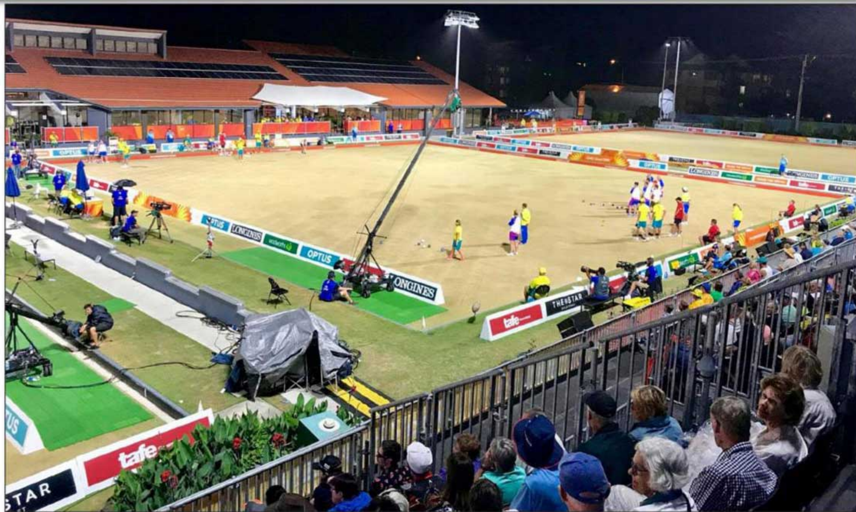
• Spectacular under lights - Broadbeach during the Commonwealth Games bowls competition.

'I was keen for a beachy/wave look to fit in with the coastline which is so close to the club and very much part of what we have always sought to achieve.